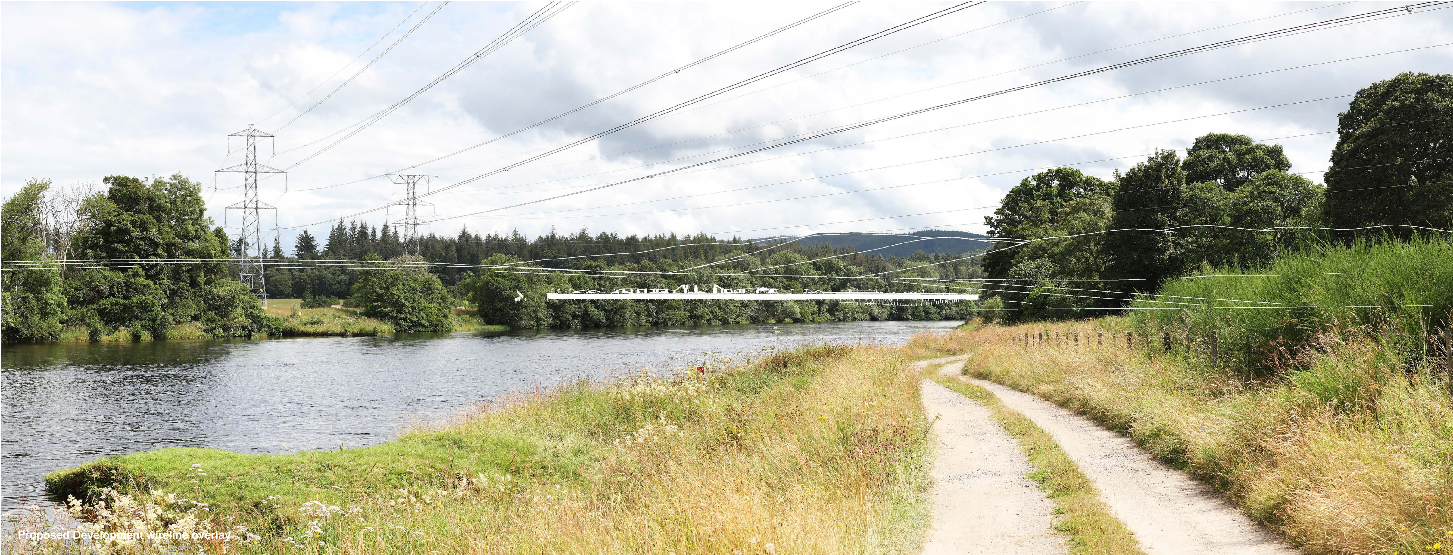
VIEWPOINT 3: View east from Core Path IN03.04 along the River Beauly