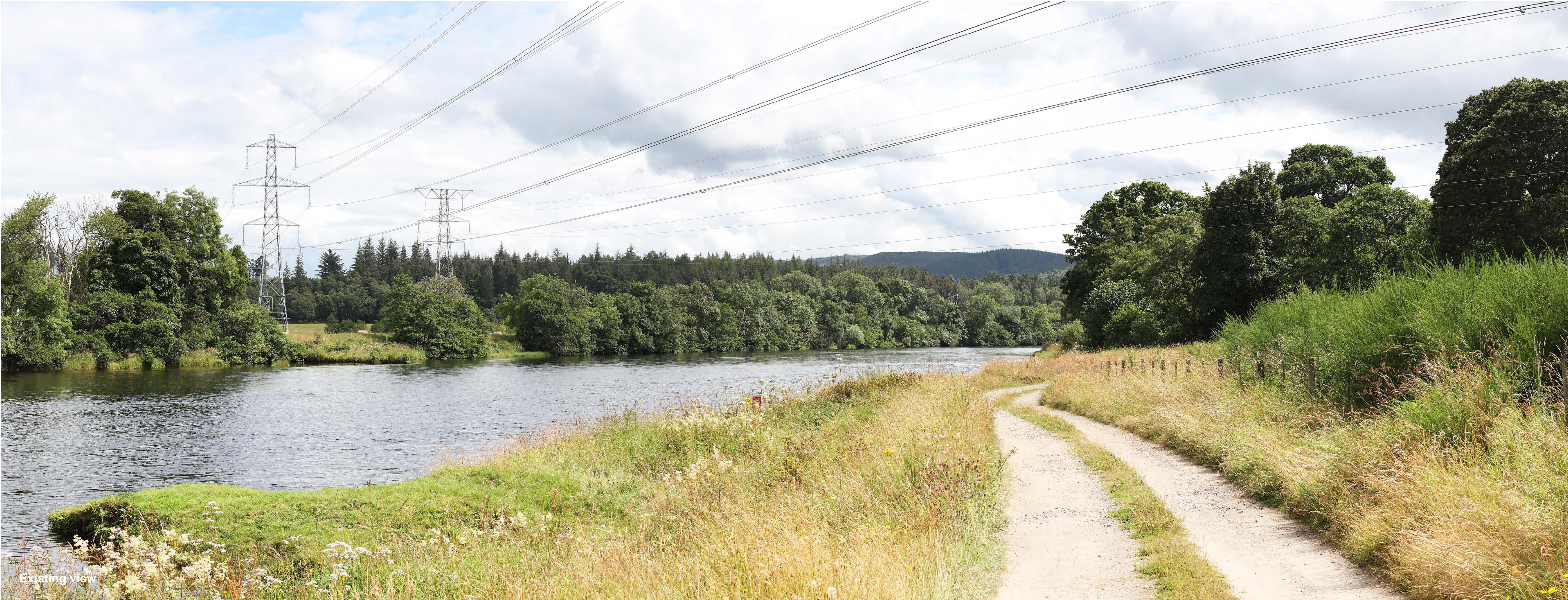
VIEWPOINT 3: View east from Core Path IN03.04 along the River Beauly